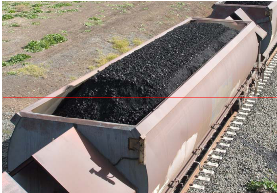
Figure 2 – Top of loaded coal wagon showing 'Garden-Bed' style profile.

veneering agents applied in order to Prevent Coal Loss. Without limiting the type of profile that the Private Infrastructure Owner may adopt, an appropriately designed and maintained telescopic loading chute can achieve a 'garden-bed' profile (standard loading profile as shown in Figure 2 below.) to mitigate the risk of coal lift-off and to optimise the effectiveness of veneering agents applied in order to Prevent Coal Loss.