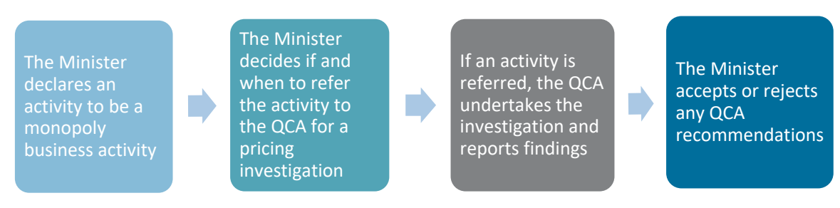
Figure 1 The monopoly prices oversight framework