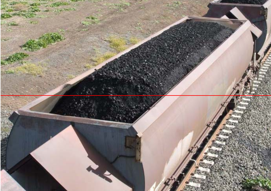
Figure 2 – Top of loaded coal wagon showing 'Garden-Bed' style profile.